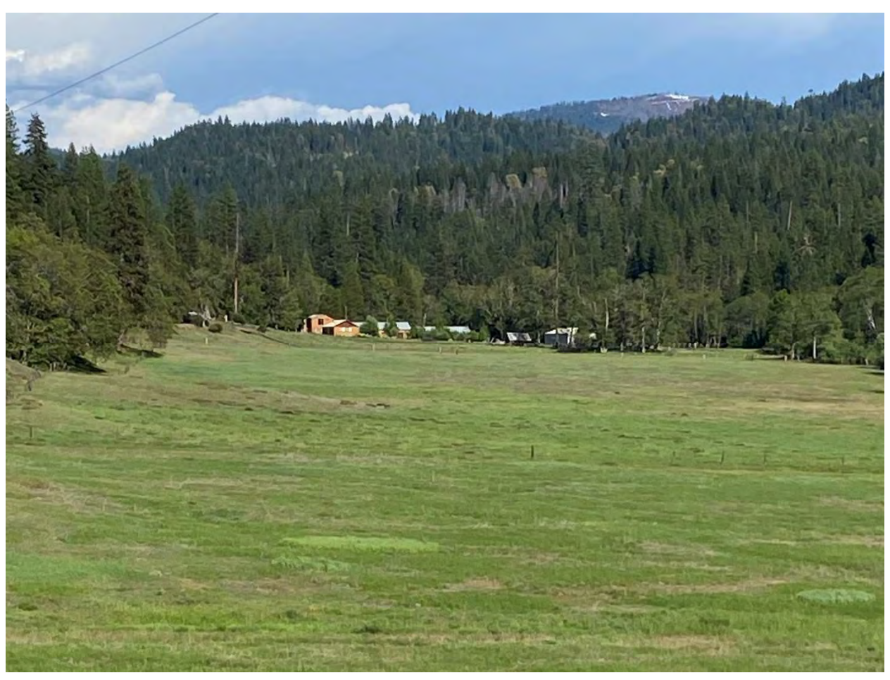
Water Rights from 1888

For information on this ranch please call: