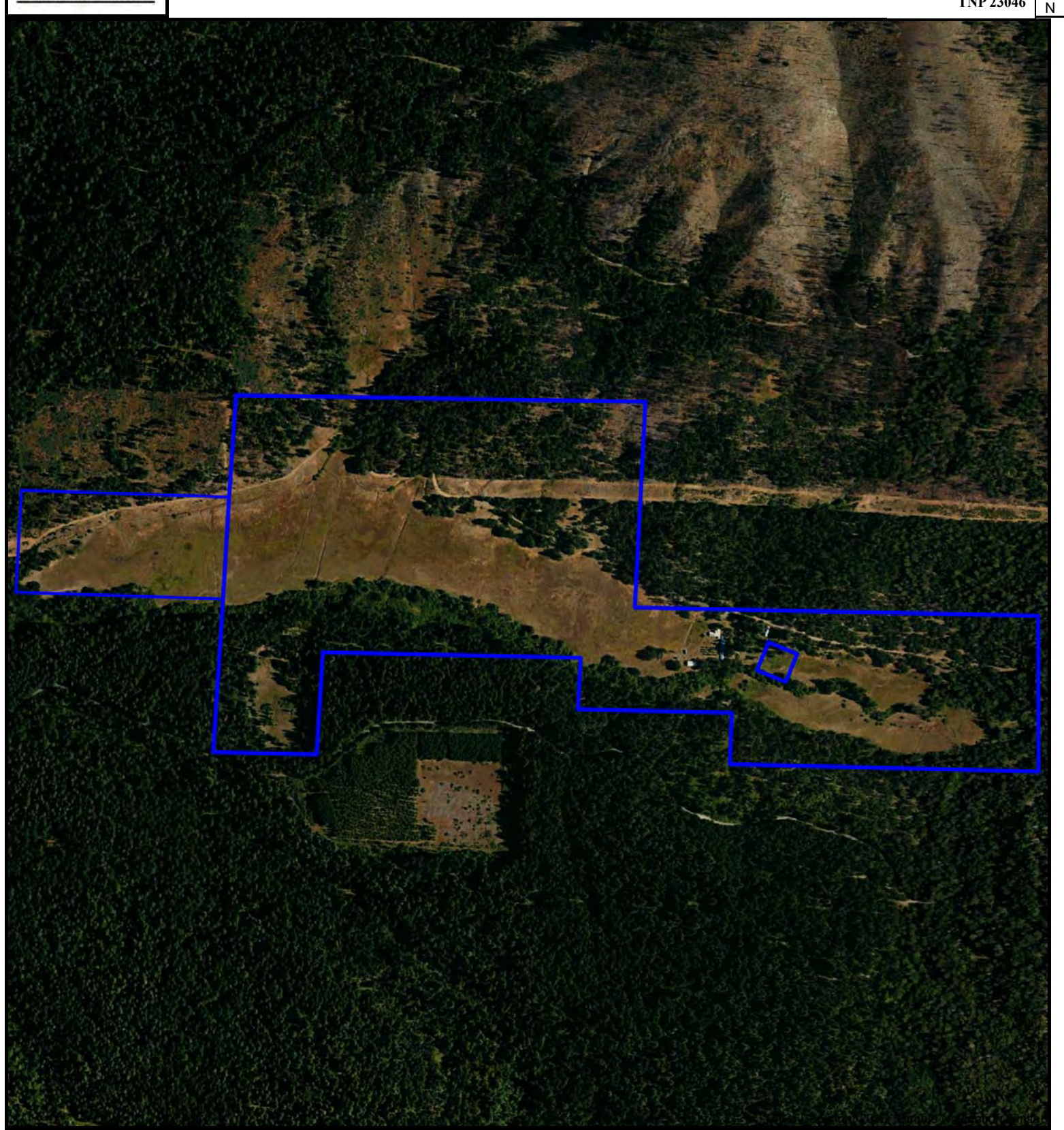
DISCLAIMER: The information contained herein is as obtained by this broker from sellers, owners, or other sources. This information is considered reliable, neither this broker nor owners make any guarantee, warranty or representation as to correctness of any data or descriptions and the accuracy of such statements. The correctness and / or accuracy of any and all statements should be determined through independent investigation made by the prospective purchaser. Any offer for sale is subject to prior sale, errors and omissions, change of price, terms or other conditions or withdrawal from sale in whole or in part, by seller without notice and at the sole discretion of seller. Readers are urged to form their own independent conclusions and evaluations in consultation with legal counsel, accountants, and/or investment advisors concerning and all material contained herein.