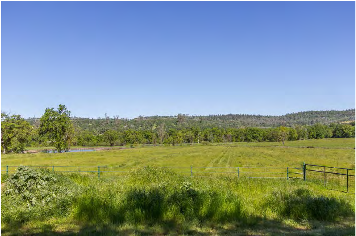
View from the deck above and elk in the fields