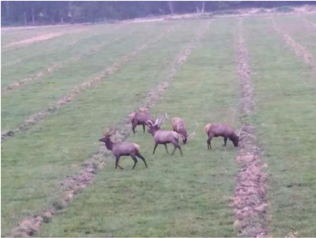
5 bulls in the fields -ranch has a snowfall at Christmas every once in a while – Lots more photos on the web site