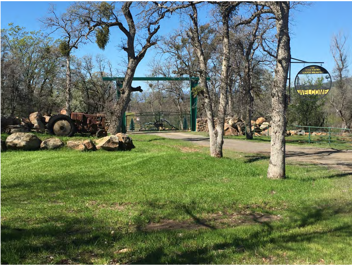
291 acres – 4 ponds, flood irrigated fields, oak covered hills